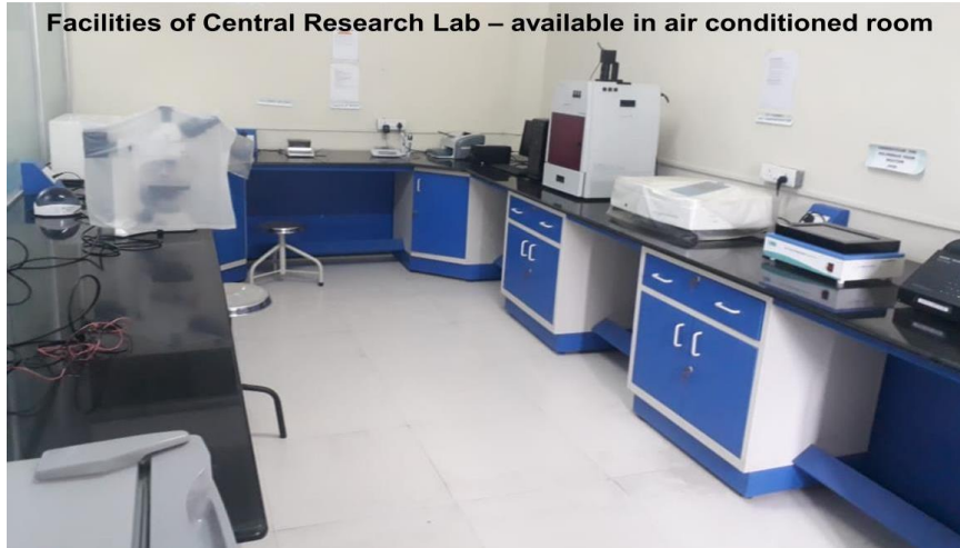
Facilities of Central Research Lab – available in air conditioned room

GST Road, Chinna Kolambakkam, Padalam (po), Chengalpattu (dt) Madhuranthagam(tk), Tamilnadu 603 308