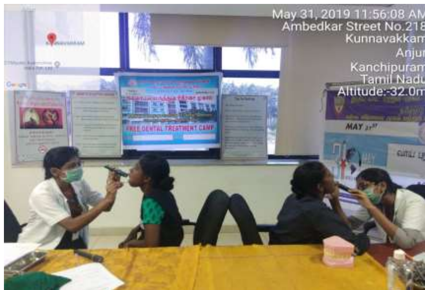
SCREENING DONE FOR THE STAFF MEMBERS