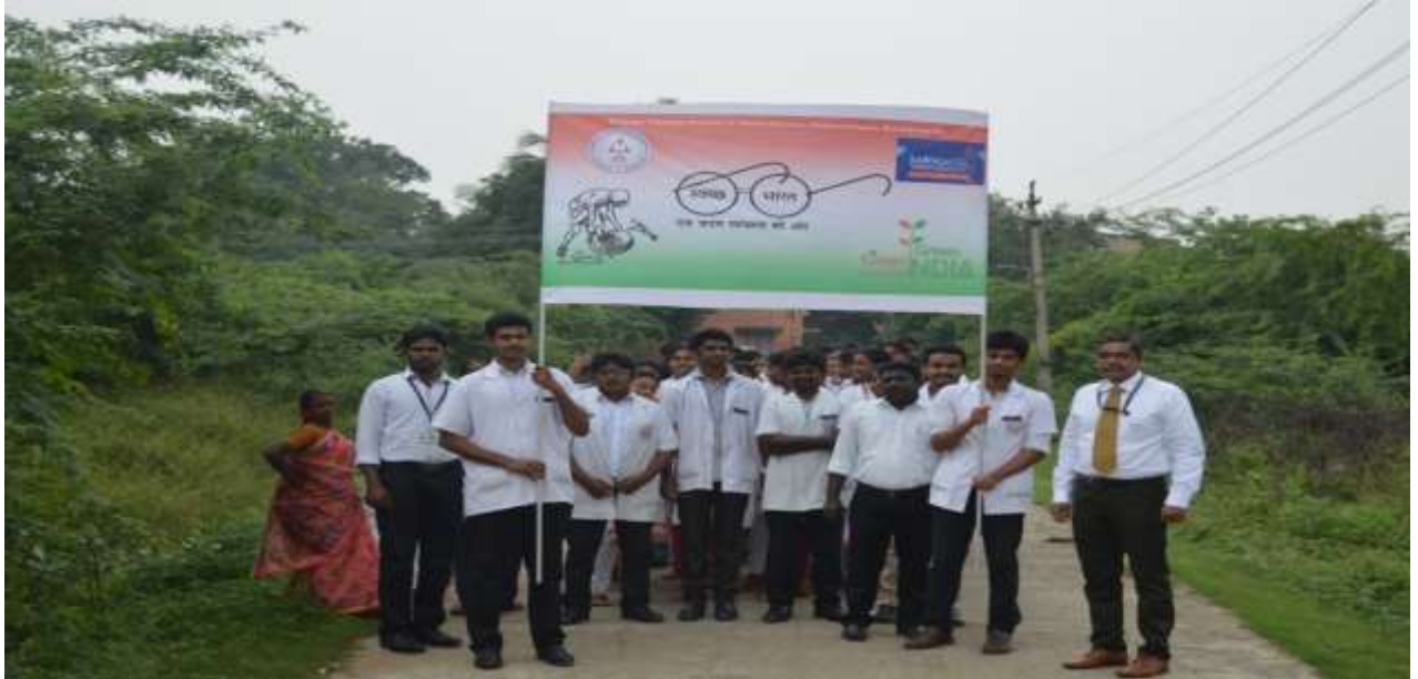
EXPLAINING ABOUT HYGIENE