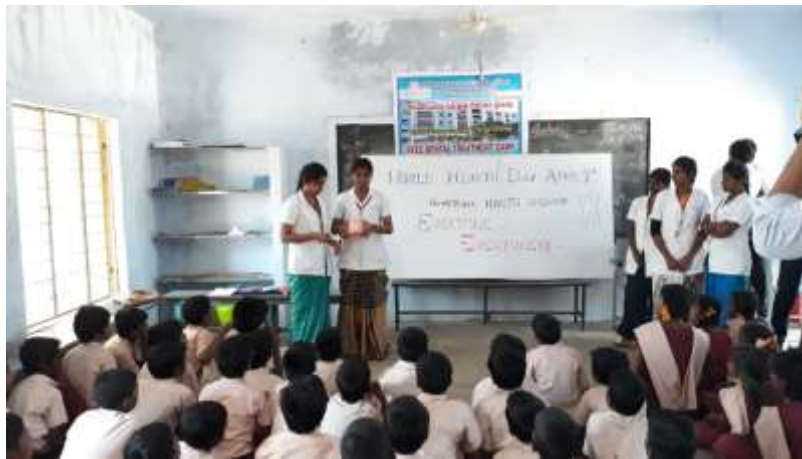
EXPLAINING THE BRUSHING TECHNIQUES TO THE STUDENTS