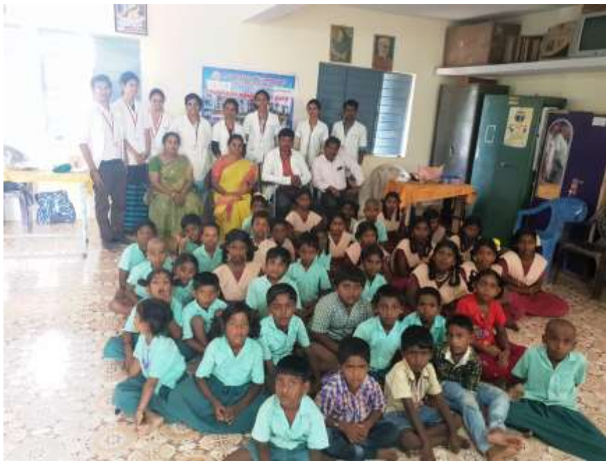
TREATMENT DONE FOR STUDENTS