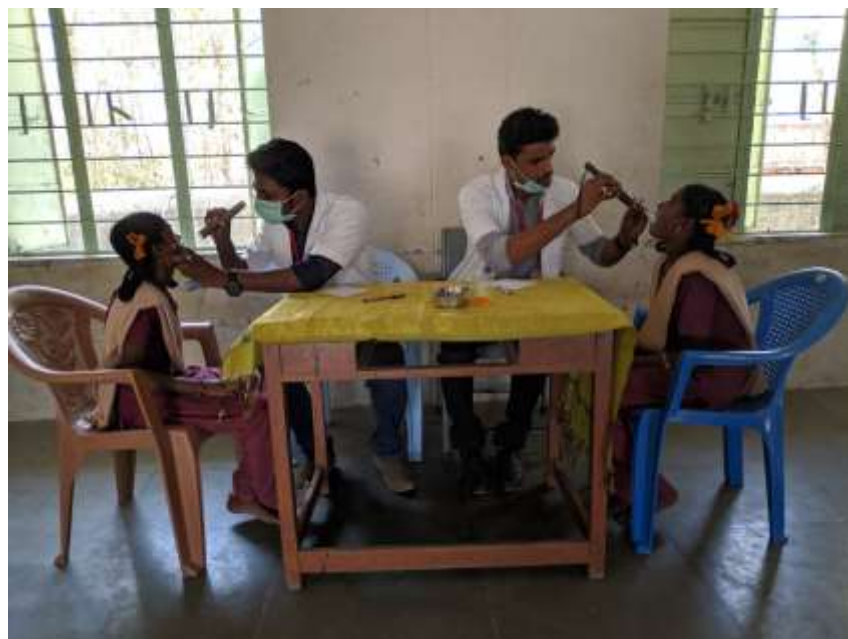
SCREENING DONE FOR THE STUDENTS

From 11 to 12 pm screening examination (no.155) was conducted for 6 th , 7 th and 8 th standard students in their respective classrooms by the team doctor.