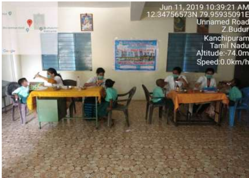
SCREENING DONE FOR STUDENTS