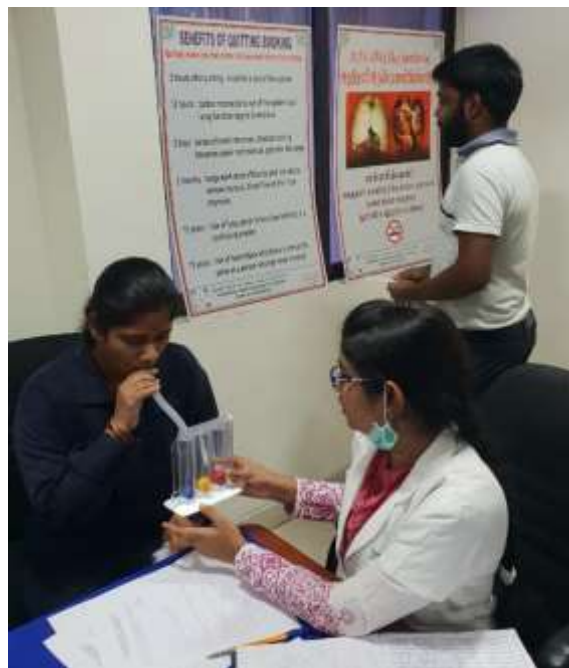
SURVEY AND DATA COLLECTIONS USING SPIROMETER