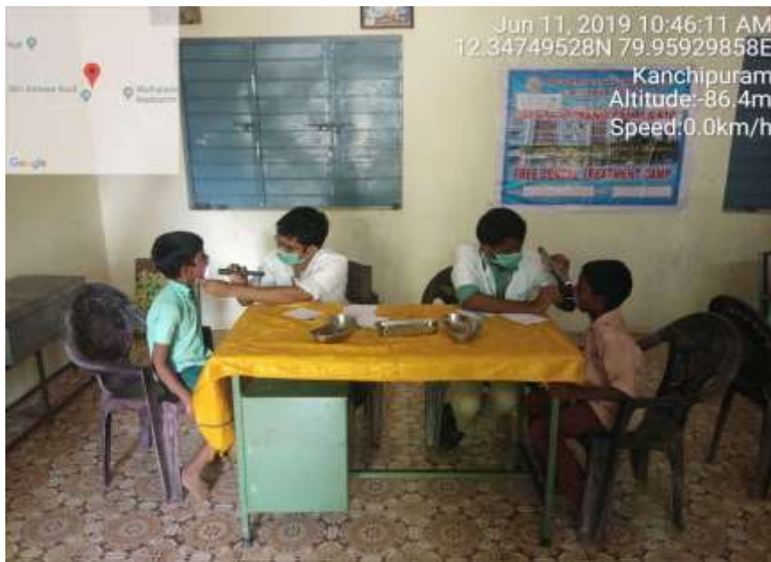
SCREENING DONE FOR STUDENTS