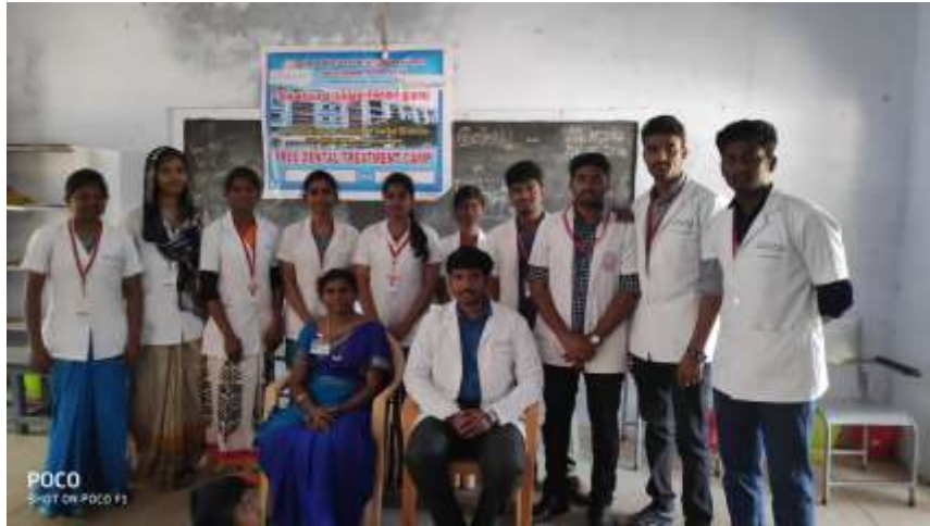
THE TEAM INVOLVED IN THE WORLD HEALTH DAY PROGRAM